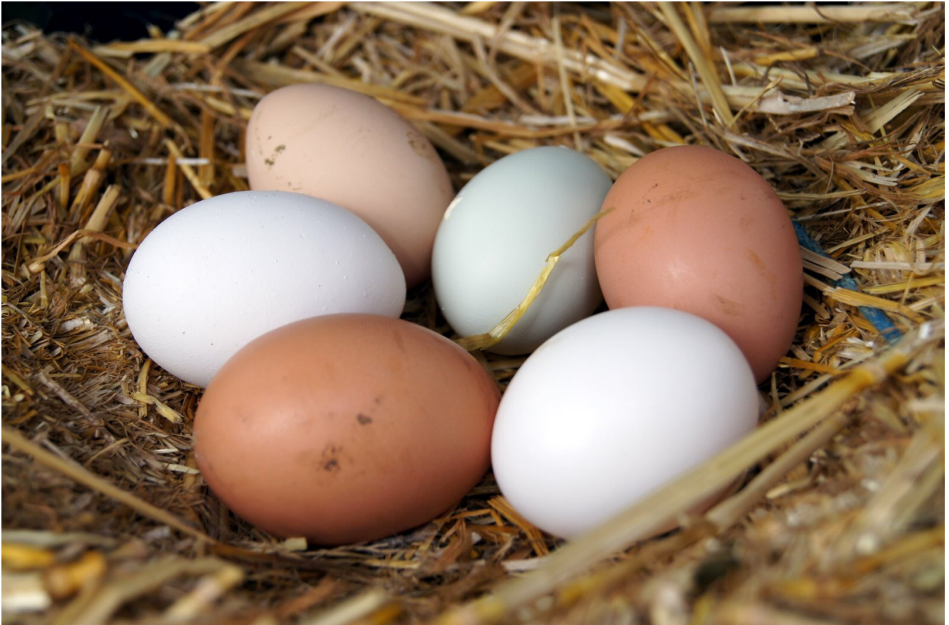
Chicken Bum creations...