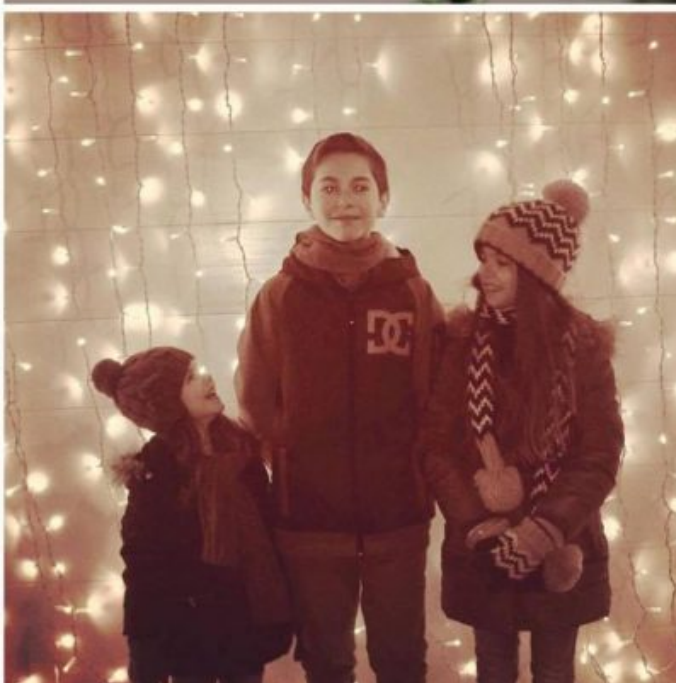
Top left: Little Hearts Big Love