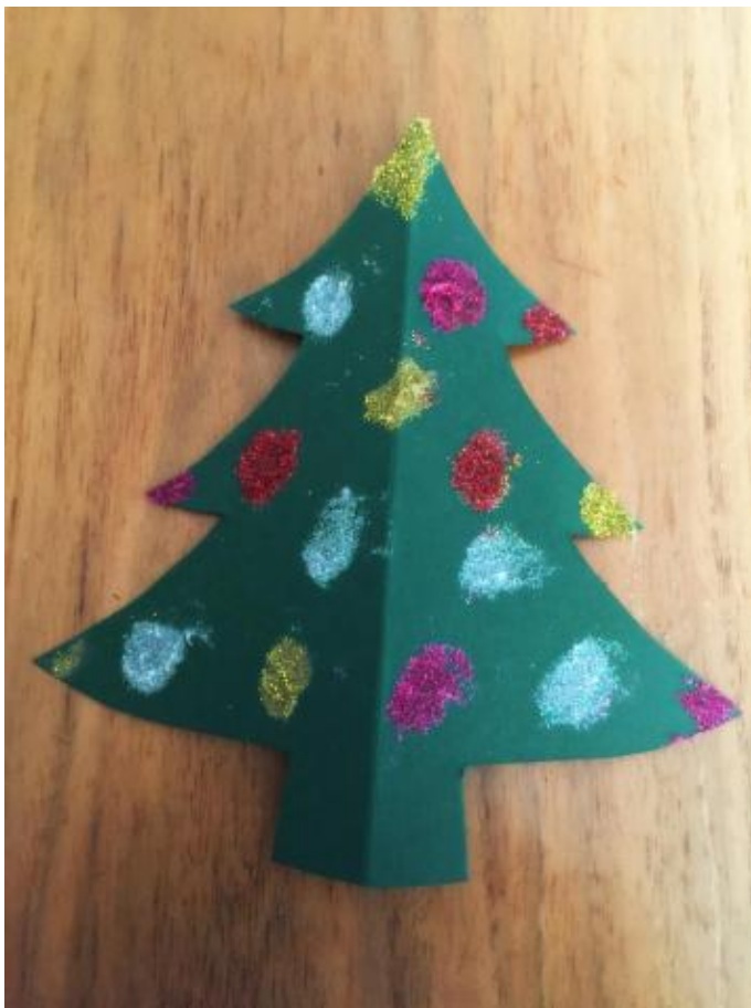
This Christmas Tree decoration or Christmas Tree topper is